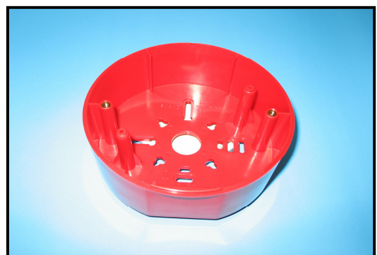
Model.FPE.CL-205 MANUAL ALARM BASE